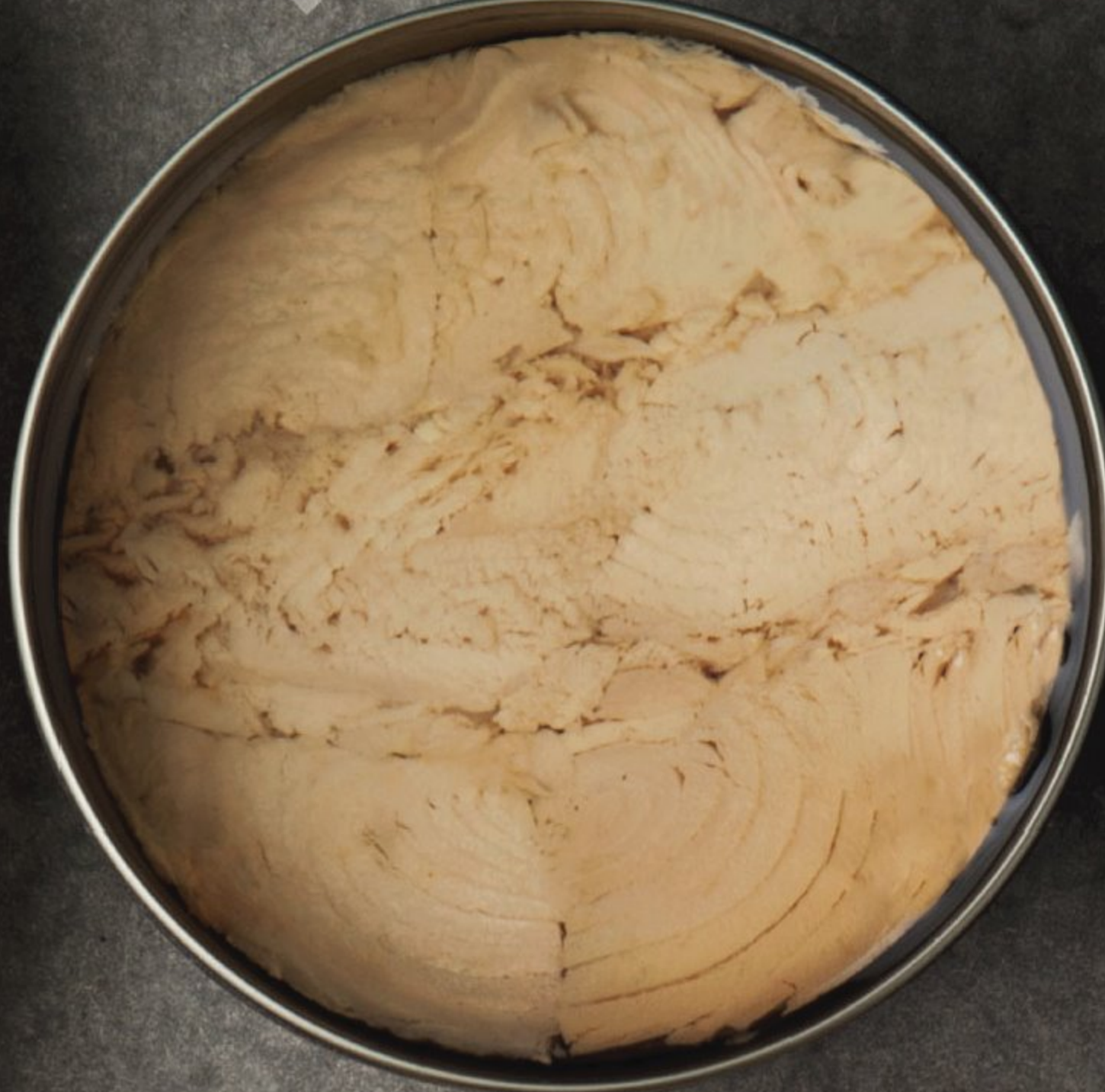
TUNA SOLID IN BRINE