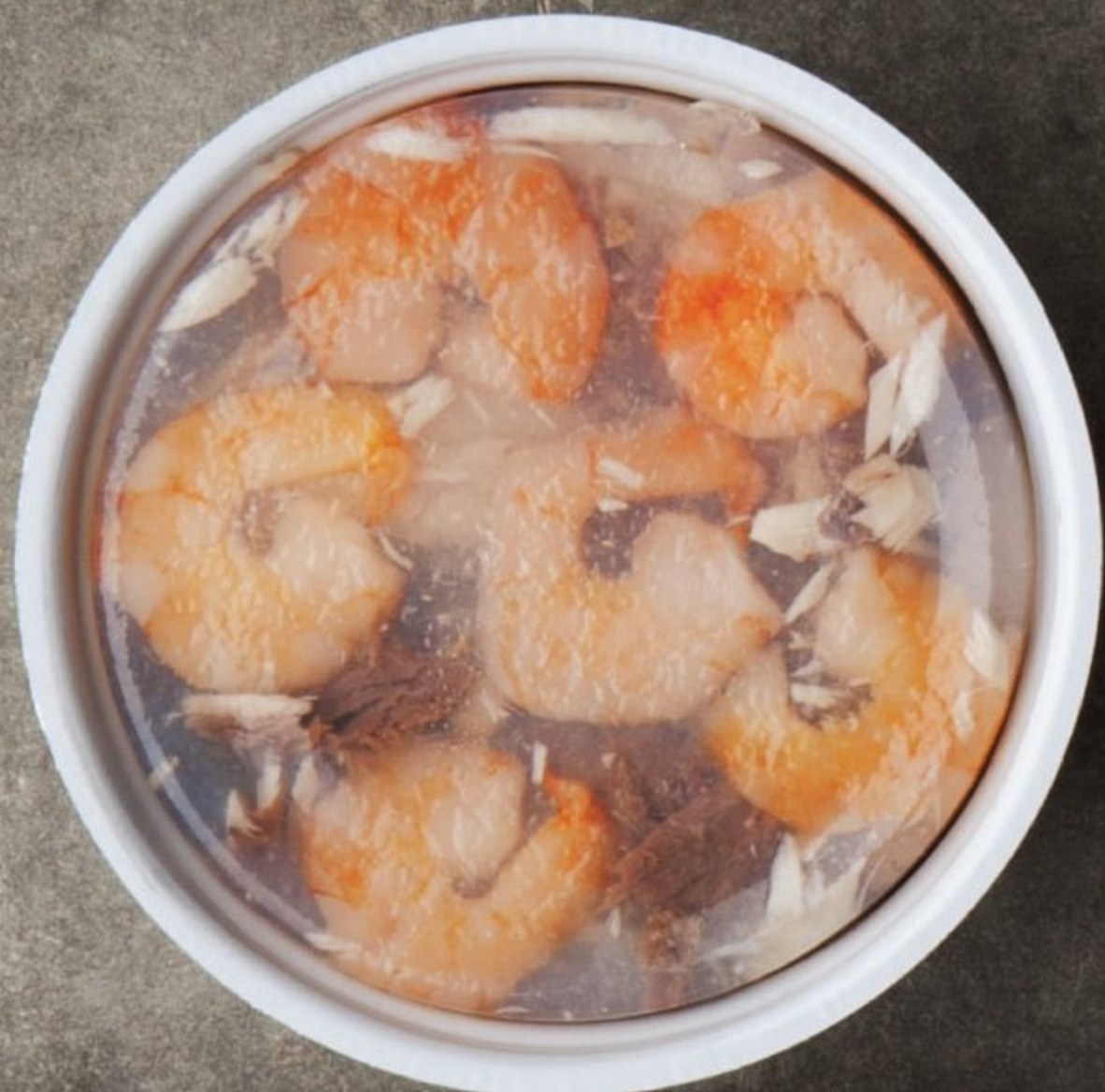
PET FOOD IN JELLY