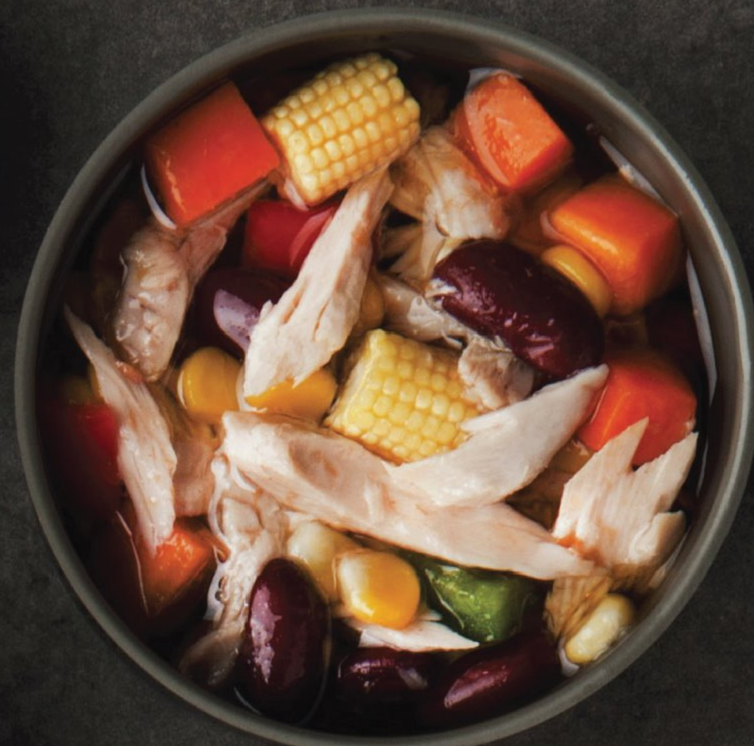
TUNA MEXICAN SALAD