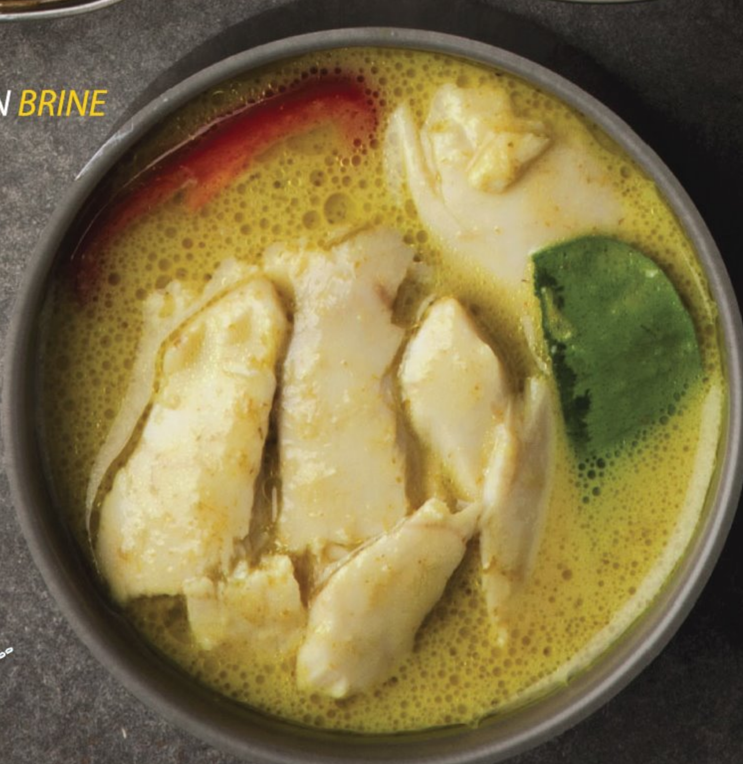
TUNA IN YELLOW CURRY