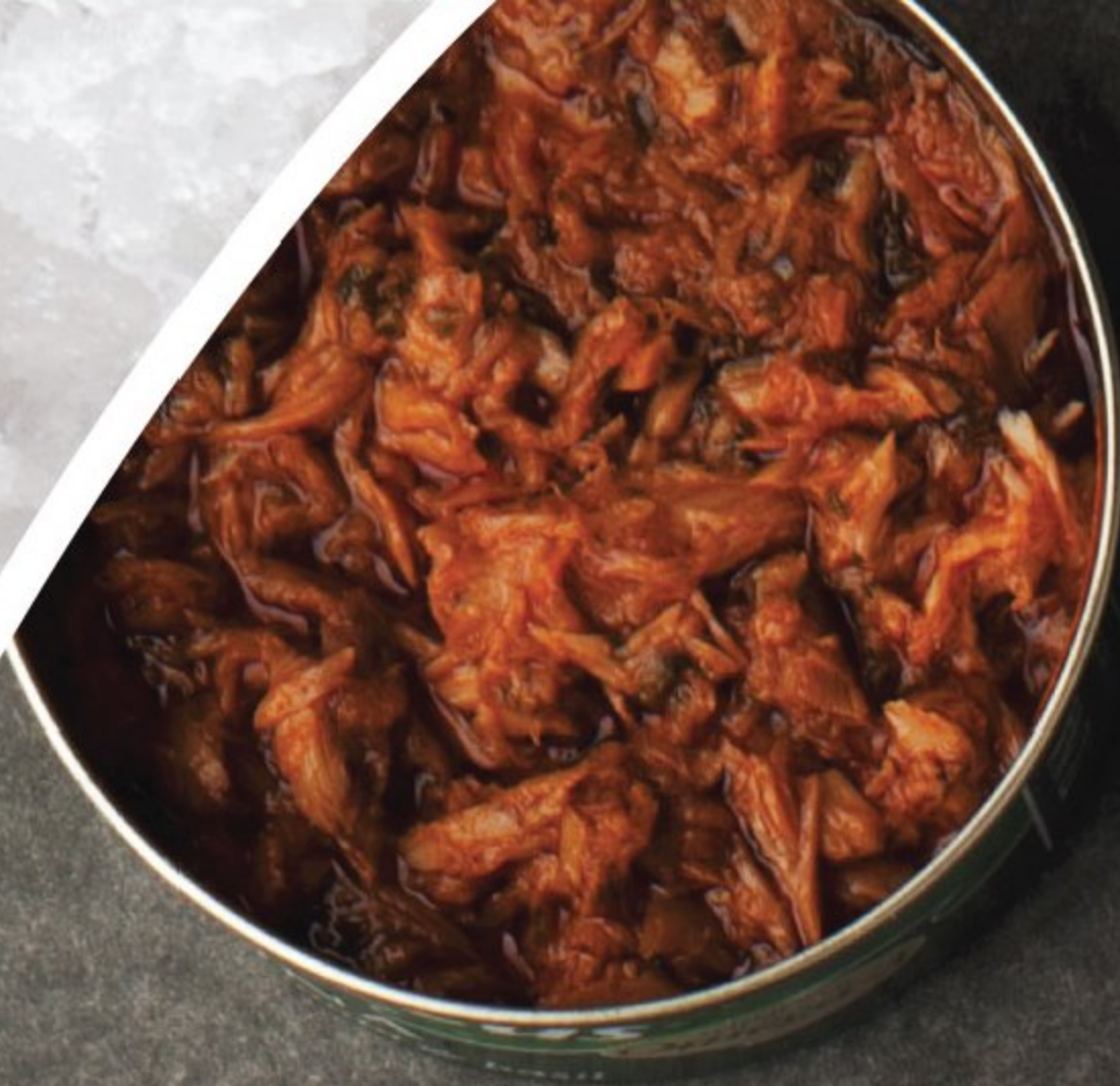
TUNA IN TOMATO SAUCE