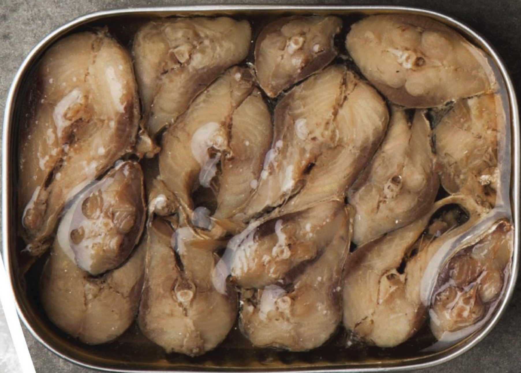
SARDINE IN BRINE