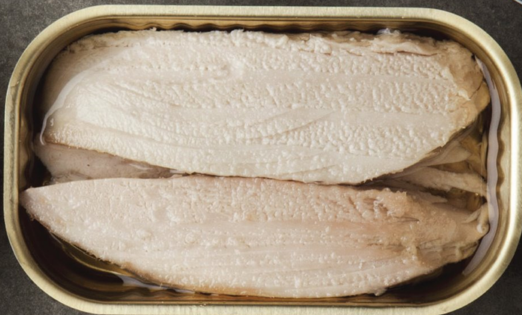
TUNA FILLET IN OLIVE OIL