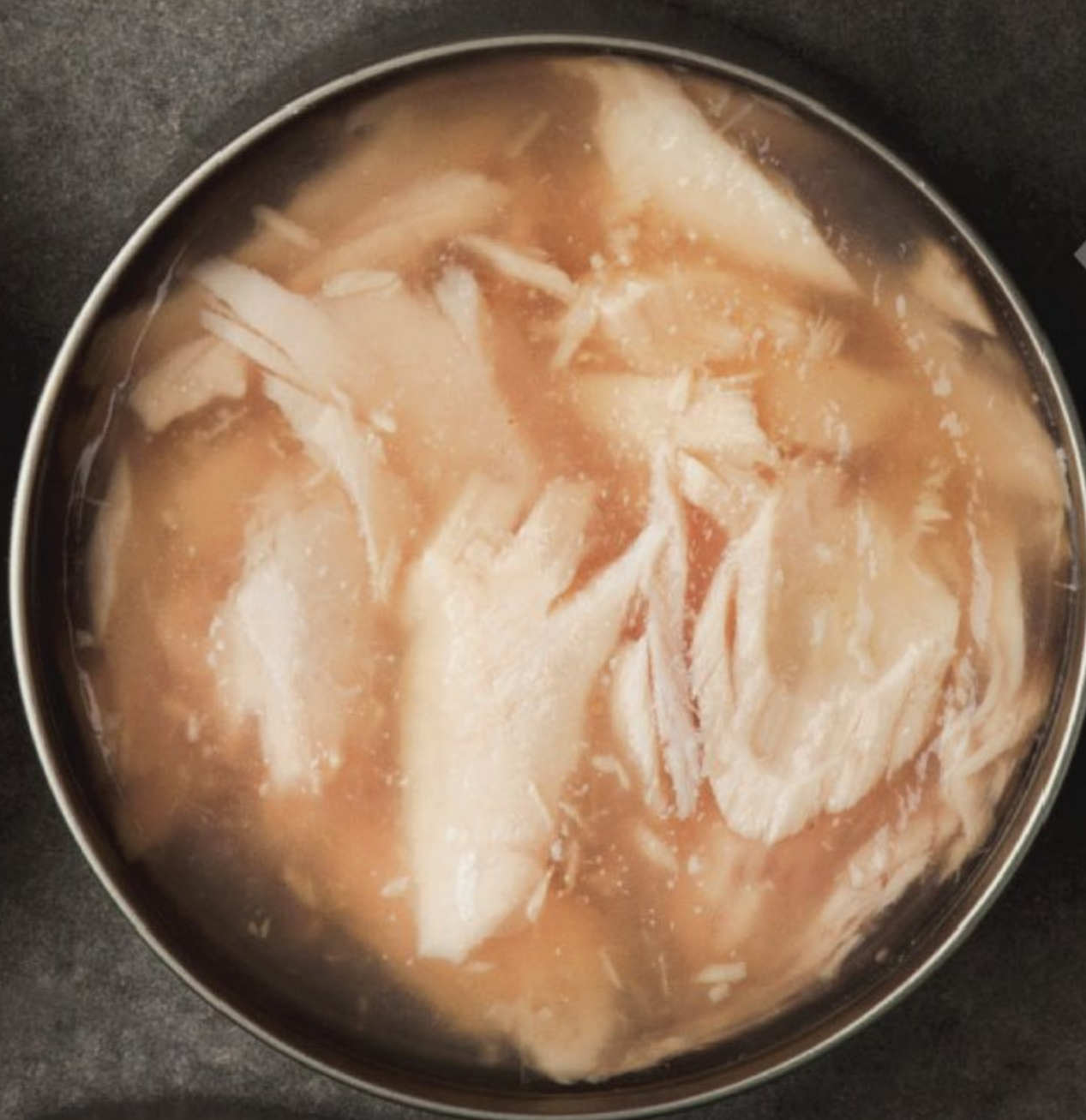
PET FOOD IN JELLY