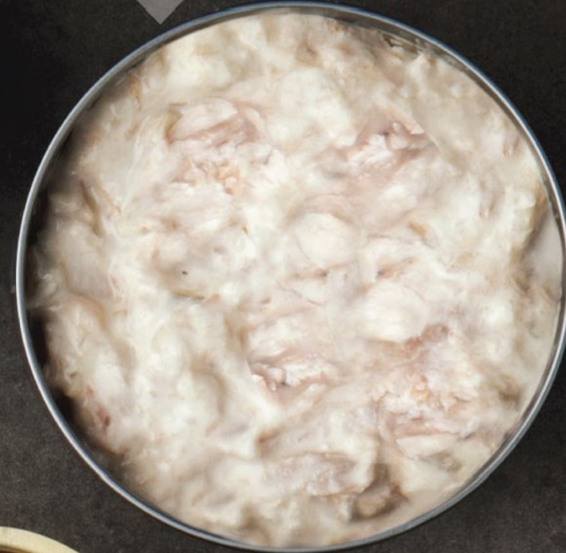
TUNA IN MAYONNAISE