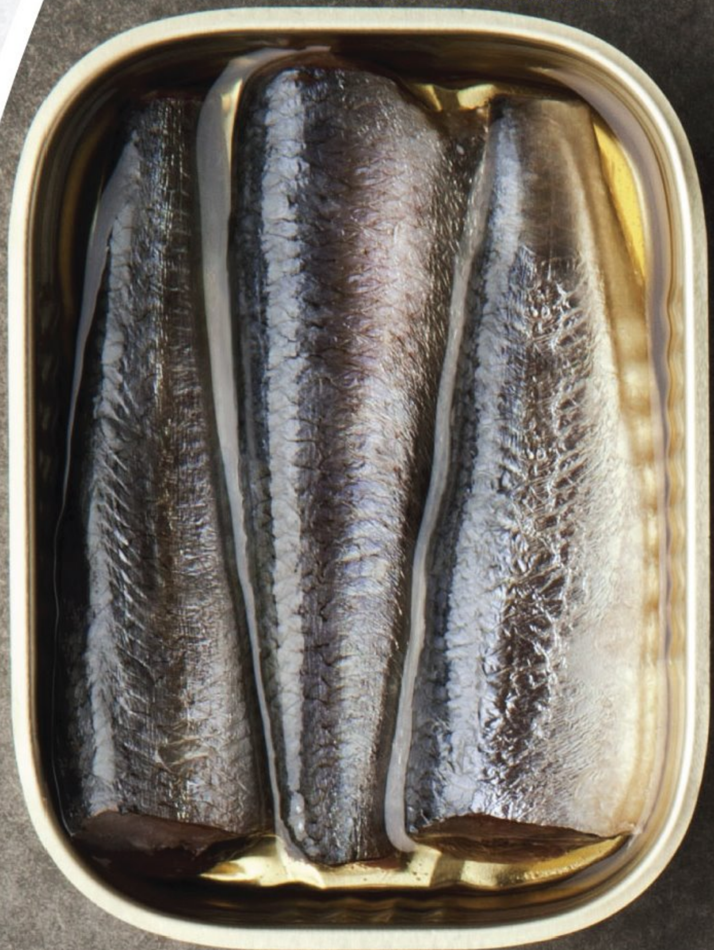
SARDINE IN OIL