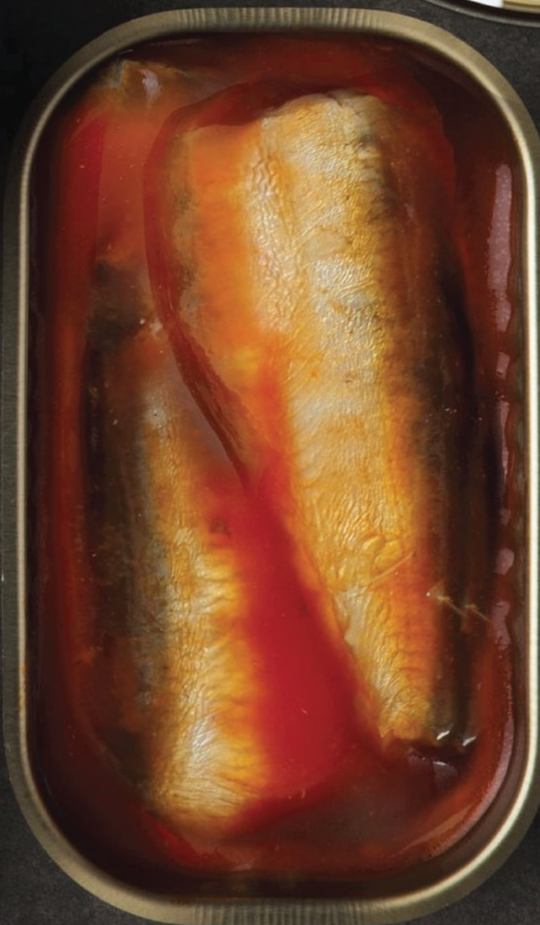
SARDINE IN TOMATO SAUCE