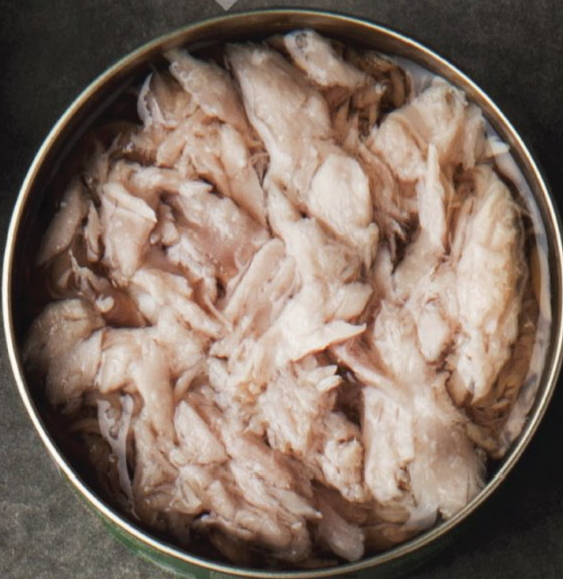
TUNA IN OIL